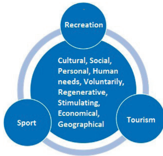
Figure 1. Some common keywords in interpretation of recreation, sport and tourism

dering their aims, task systems and research tools, what is more, there are more similarities than differences between them (Figure 1). This is especially true when considering those areas which are related to one another and can be found on the boundaries of the new sciences. Examples include sport tourism, sport recreation and recreational tourism.