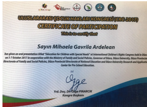
Figure 7. Certificate of participation in conference on education of the Aurel Vlaicu University of Arad