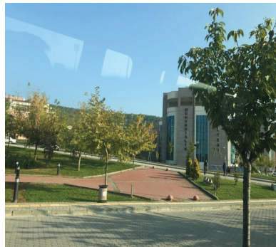
Figure 3. University Campus of Düzce University