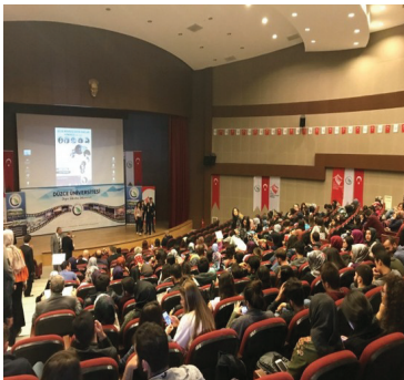
Figure 2. Congressional activities

The following pictures show the congressional activities.