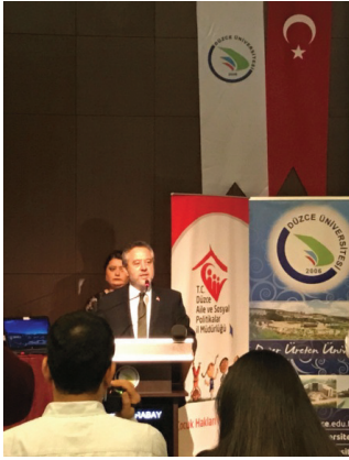
Figure 4. Mr. Vice-Minister of Family and Social Policies of Turkey in opening