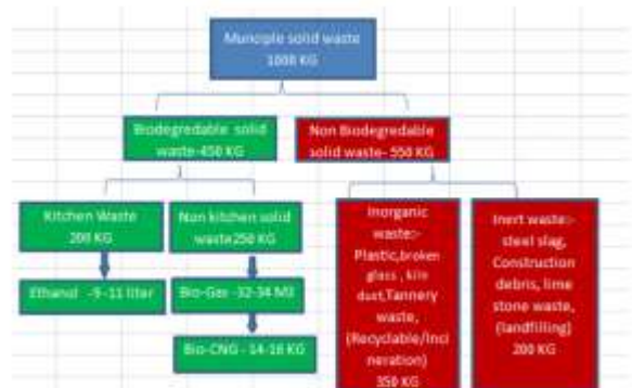
Figure 1. Composition of municipal solid waste that can be treated as a source for production of the necessary energy. From (Soni et al., 2016)

Moreover, with proper treatments the biodegradable part of the solid waste can be successfully used for the obtaining of the biodiesel, Bio-CNG, Fuel ethanol and liquid manure. The non-biodegradable part, after recycling can be further used for incineration or landfilling.